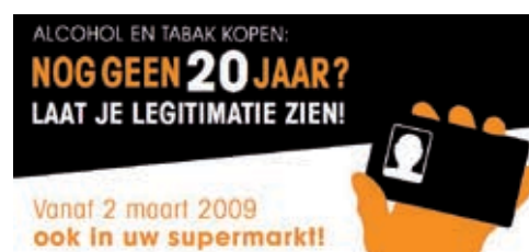
Supermarket campaign for an ID check

In all places where tobacco products are sold, a clear and legible sign indicating that tobacco is not sold to persons younger than 16 must be present (Tobacco Act Article 8.3). No national sign exists, so branch organizations developed their own signs. Tobacco and convenience stores use a sign developed by the branch organization for tobacco retail (NSO) that indicates that tobacco products will only be sold after showing a valid ID (100) . Since March 2009, employees of supermarkets have been required to ask anyone who looks younger than 20 years of age for an ID, because supermarkets feel this is a better way of avoiding selling tobacco (and alcohol) to minors. This was a branch agreement by all supermarkets, communicated to the general public with a television commercial, posters, and stickers in the supermarkets (101) .