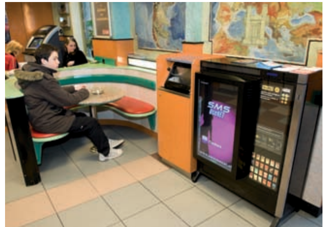
Tobacco promotion through a tobacco vending machine

Ninety-six percent of the sellers surveyed said that they put a sign on the vending machines indicating the minimum age of 16 for buying tobacco. Still, 12% of the employees had difficulties with checking the age of persons buying tobacco from a vending machine (99) .