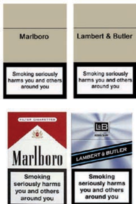
Examples of plain packs (without graphic warnings)

The Dutch labelling decree for tobacco products is restricted to the obligation to disclose the tar, nicotine and carbon monoxide levels on cigarette packages and the tar and nicotine levels on roll-your-own tobacco. Further qualitative statements about the health risks of particular tobacco smoke constituents is currently not required. The current text warnings clearly are not consistent with Article 11.2 of the FCTC.