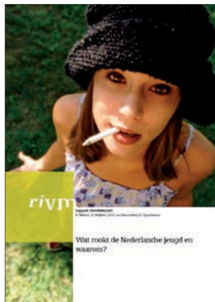
Report by RIVM on attractiveness of cigarettes to children

A 2009 national study of Dutch adolescents (10-18 years), showed that for two-thirds of those who smoked, taste was the most important reason to choose their brand of cigarettes (58) . Having positive expectations about the taste was one of the important reasons for taking up smoking. As a result, it was recommended to restrict additives (especially those influencing taste) in tobacco products. Ab Klink reacted to these recommendations by again emphasizing the international procedure for regulating tobacco contents (59) . Neither is the current Minister of Health, Edith Schippers, in favour of regulating tobacco product ingredients: I do not intend to further regulate the composition of tobacco products, because it does not fit within the tobacco control policy I have in mind. (60)