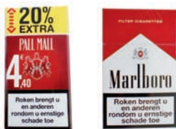
Current health warning

The Netherlands was the first EU country to introduce text health warning labels in accordance with Directive (2001/27/EC), in May 2002. Specifications for the regulations are described in the ‘Labelling decree for tobacco products’ (66) , which is adjusted to EU Directive 2001/27/EC on the manufacture, presentation and sale of tobacco products (67) . In the Netherlands, warning labels should cover at least 30% of the front and 40% of the back of the package. On both sides the warning labels are placed at the bottom of the display area. This meets the minimum required by FCTC. The use of misleading texts, names, trademarks and figurative or other signs about the harmfulness of the tobacco product is prohibited by law (Tobacco Act).