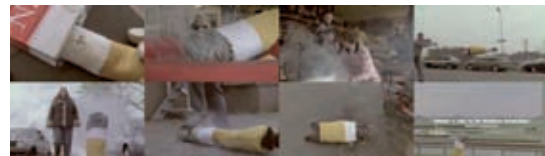
Stills from the Ministry of Health’s media campaign showing anthropomorphized cigarettes being kicked out of bars

To support the implementation of the smoking ban in workplaces in 2004, a national campaign was conducted that focused on the harm of environmental tobacco smoke to non-smoking employees. In 2008, the smoking ban in the hospitality industry was complemented with a national mass media smoking cessation campaign from April 2008 to January 2009 (see also the section on Article 12) and with an educational campaign called ‘Rookvrije horeca’ to inform the public about the new legislation. This campaign, which was run by the Government, focused on the fact that cigarettes were not allowed rather than on the harmful effects of exposure to tobacco smoke. The campaign consisted of two television spots, in which an anthropomorphized cigarette was kicked out of a bar. (52) The campaign did not include information about the health effects of second-hand smoke. The absence of this information may have contributed to the lower rates of compliance with smoke-free legislation in the Netherlands compared with countries like France and Ireland, which supported their smoke-free laws with a media campaign in which the health effects of environmental tobacco smoke were explained (3, 53) .