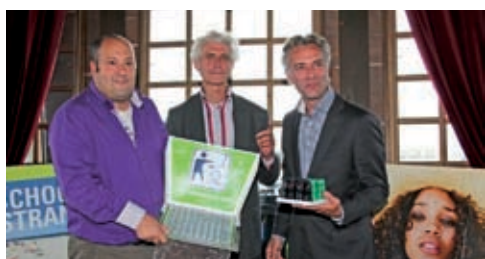
Director Corporate Affairs Japan Tobacco International (r) promoting cigarette litter clean-up campaign

The Dutch tobacco industry is actively using an image of corporate social responsibility for promotional purposes. For example, Japan Tobacco International has partnered with Stichting Nederland Schoon (Keep Holland Tidy Society), and the municipality of Zandvoort to reduce cigarette litter on the beaches in the municipality (81) . This example of apparent corporate social responsibility could be regarded as promotion for JTI that is not in line with FCTC article 13.